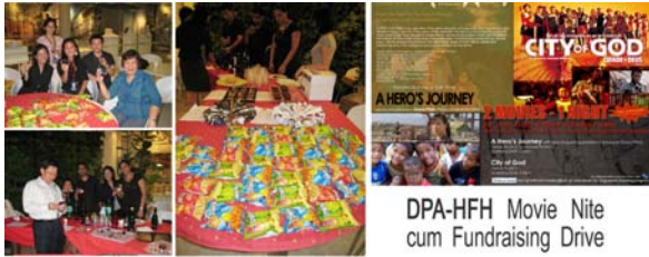
DPA-HFH Movie Nite cum Fundraising Drive

The habitat team's magic bag came up with yet another fund raising event! A screening of 2 movies in the common area between Studio 2@ 200 and Studio 3. The movies were chosen as they spoke to the heart of our cause, the problems and strife of the underprivileged and living conditions of slums.