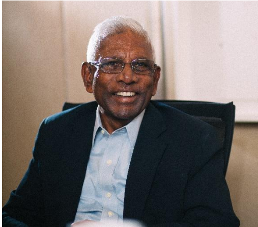
Our Patron Mr. S. Dhanabalan

Habitat for Humanity Singapore is very proud to have Mr. S. Dhanabalan (ex-Chairman, Temasek Holdings; ex-Cabinet Minister) as our patron. Mr. Dhanabalan is an active Habitat volunteer who participates in Habitat builds and events throughout the year. He continues to be a great source of inspiration and wisdom for many Habitat staff and volunteers.